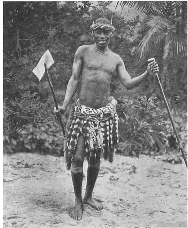
PLATE 21. B.W. Caney (photographer). Curiosity Land for Young People , 1908. Item 275. Halftone.