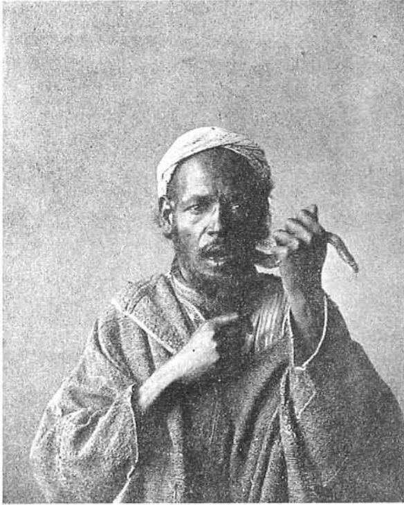
PLATE 20. [Photographer unknown.] Snap Shots with Tales of Travel Truthfully Told , 1898. Item 107. Halftone.