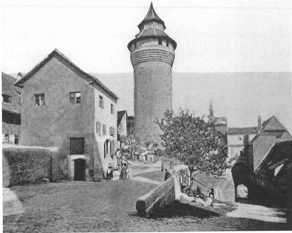
PLATE 18. [Photographer unknown.] To Nuremberg and Back , 1892. Item 61. Halftone.