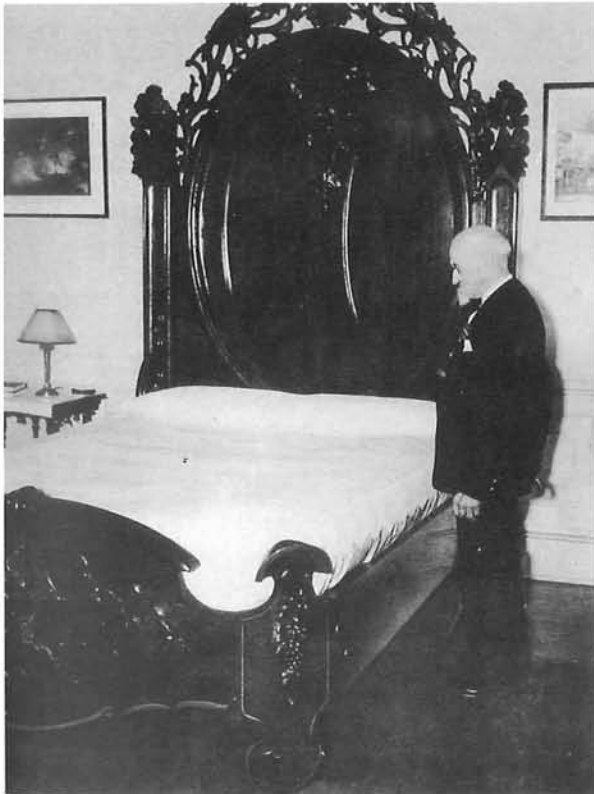
PLATE 22. Underwood & Underwood (photographers). A Trip to Washington with Bobby and Betty , 1935. Item 968. Halftone.