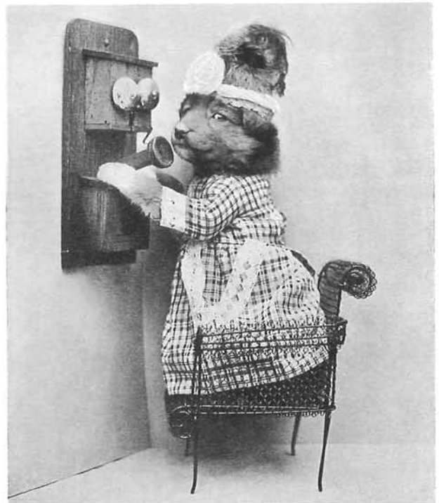
PLATE 3. Harry Whittier Frees (photographer). The Little Folks of Animal Land , 1915. Item 442. Halftone.