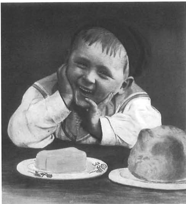
PLATE 2. Nursery Rhymes: Old Favourites, New Pictures , ca. 1910. Item 335. Three-color halftone.