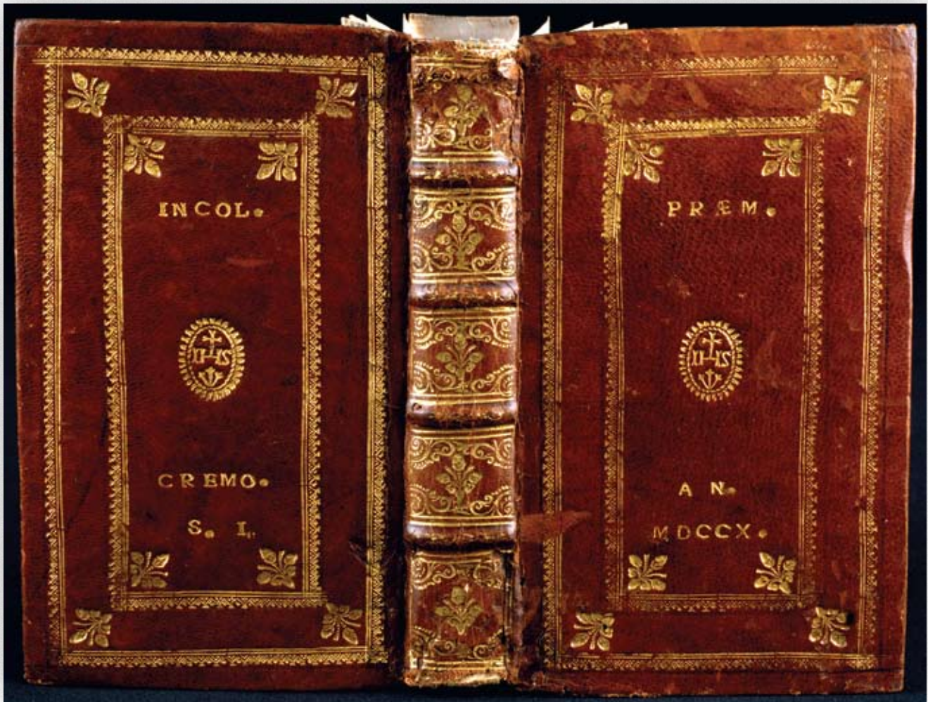
Plate 22. Padua, Ex Tipografia del Seminario , 1701: prize binding

(see binding); front pastedown, label, JSM Collectio Virgiliana